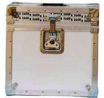
Size: 11.5" x 16.5" x 17"