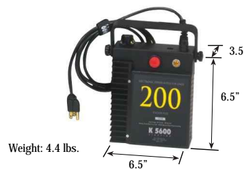
Weight: 4.4 lbs.