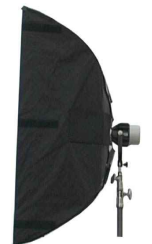
JN200 in Lightbank