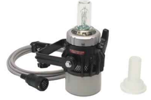
JN200 with Clear and Frosted Beaker