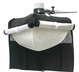
JN200 in Lantern